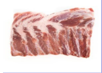
Fresh Spare Ribs $2.99 LB