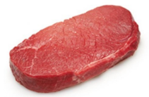
USDA Choice Top Round London Broil $6.39 LB