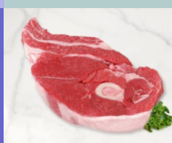
Frozen Shoulder Round Bone Lamb Chops $4.99 LB