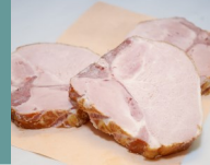
Smoked Center-Cut Pork Chops $3.29 LB