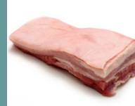
Fresh Pork Bellies $2.99 LB