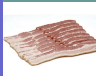
Sliced Slab Bacon $3.99 LB