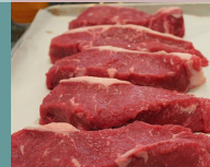
USDA Choice Butter Steaks $7.39 LB