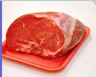
USDA Choice Top Round Roast $5.49 LB