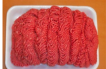
Family Pack Fresh Ground Beef $3.69 LB