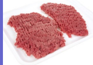
USDA Choice Cubed Steaks Or Peppered Steaks $5.99 LB