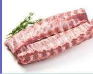
Baby Back Spare Ribs $3.99 LB