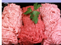
Family Pack Meatloaf Mix $3.29 LB