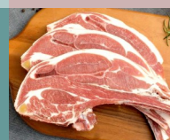
Frozen Shoulder Blade Lamb Chops $4.89 LB