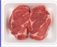
USDA Choice Chuck Fillet Steaks $5.99 LB