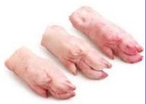
Pigs Feet $1.69 LB