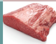
USDA Choice Cry-O-Vac Beef Brisket $4.69 LB