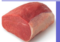
USDA Cry-O-Vac Eye Round Roast $4.99 LB