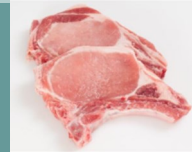
Family Pack Center-Cut Pork Chops $2.39 LB