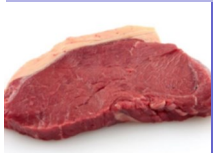
USDA Choice Shoulder Steaks Or Rump Steaks $5.49 LB