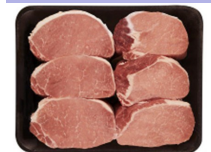
Family Pack Loin End Pork Chops $1.79 LB