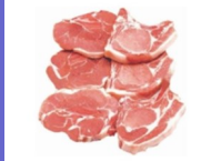
Family Pack Rib End Pork Chops $1.79 LB